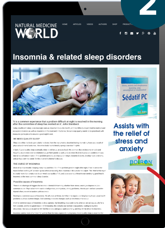
natmedworld.com web banner